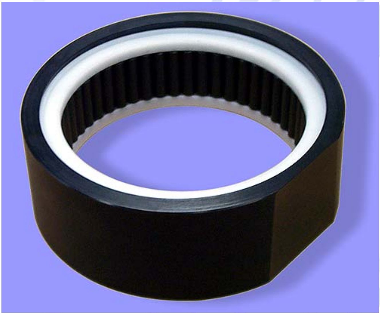
Bottom bearing with conical outer housing and flatted side to prevent rotation.