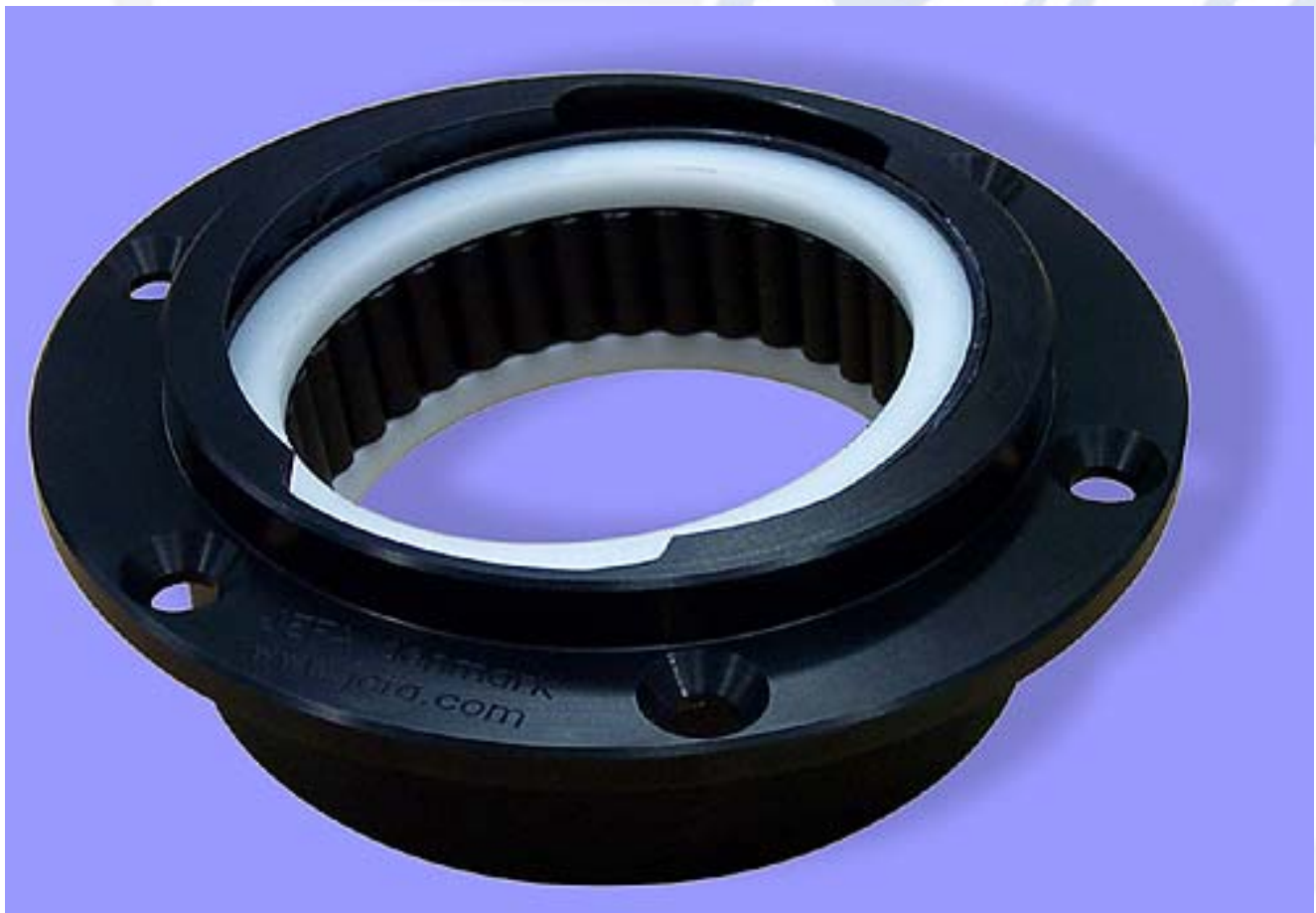
Bénéteau First type self aligning top roller bearing.